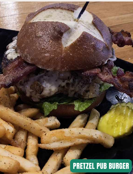
PRETZEL PUB BURGER