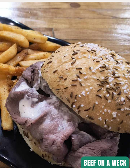
BEEF ON A WECK

SLOW COOKED SHAVED SIRLOIN, TOPPED WITH PEPPERS, ONIONS, MUSHROOMS AND MELTED PROVOLONE, ON A TOASTED HOAGIE ROLL.