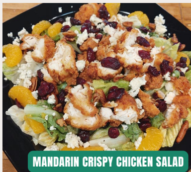
MANDARIN CRISPY CHICKEN SALAD

SERVED WITH FRIES, AND SIDES OF SALSA AND SOUR CREAM.